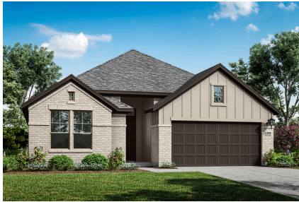
EXTERIOR STYLE J

1,793 Sq. Ft. | 3 Bed | 2 Bath | 2.5 Bay Garage | +Flex