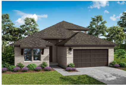
EXTERIOR STYLE J

2,410 Sq. Ft. | 4 Bed | 3.5 Bath | 2 Bay Garage | +Game Room