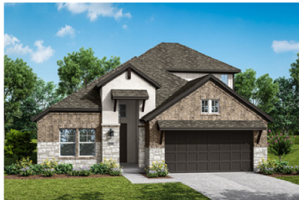
EXTERIOR STYLE L