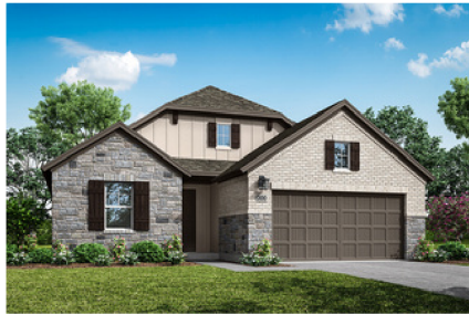
EXTERIOR STYLE K