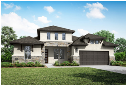
EXTERIOR STYLE B