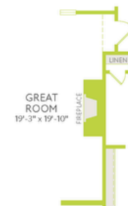
Opt. Fireplace At Great Room