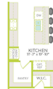
Opt. Gourmet Kitchen