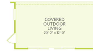
Opt. Sliding Glass Door