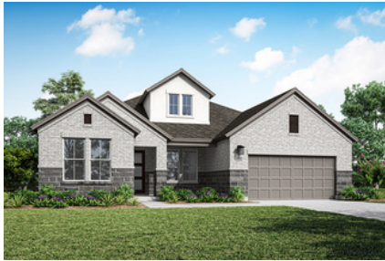
EXTERIOR STYLE A

2,779 Sq. Ft. | 4 Bed | 3 Bath | 3 Bay Garage | + Office