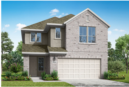
EXTERIOR STYLE W

2,404 Sq. Ft. | 3 Bed | 2.5 Bath | 2 Bay Garage | + Game Room