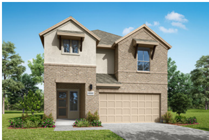
EXTERIOR STYLE Y