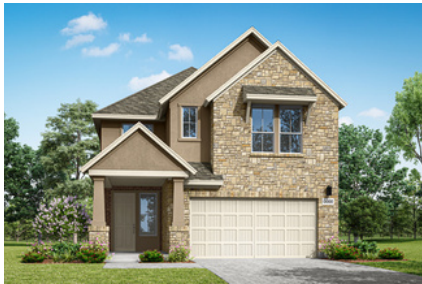
EXTERIOR STYLE X