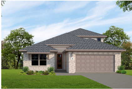
EXTERIOR STYLE A

2,466 Sq. Ft. | 4 Bed | 3.5 Bath | 2 Bay Garage | +Game Room