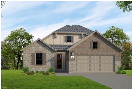
EXTERIOR STYLE B