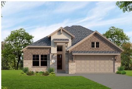
EXTERIOR STYLE C