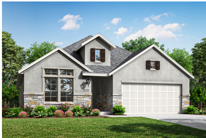
EXTERIOR STYLE C