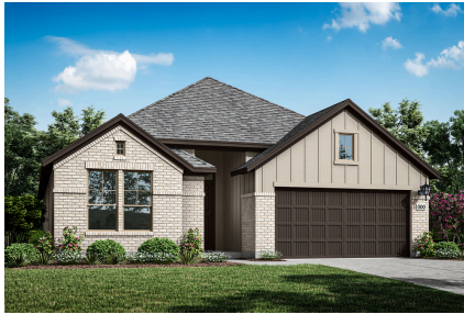
EXTERIOR STYLE A

1,838 Sq. Ft. | 3 Bed | 2 Bath | 2.5 Bay Garage | + Flex