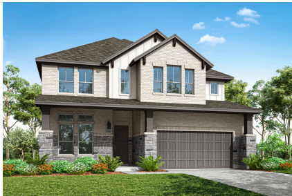
EXTERIOR STYLE B