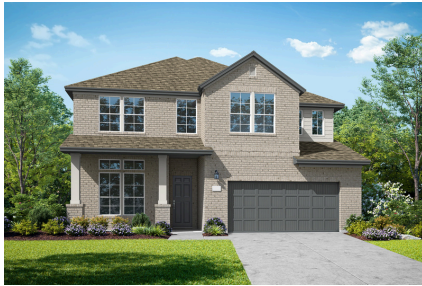
EXTERIOR STYLE A

2,653 Sq. Ft. | 4 Bed | 2.5 Bath | 2 Bay Garage | + Flex + Loft