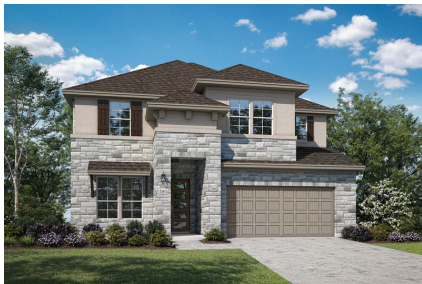
EXTERIOR STYLE C