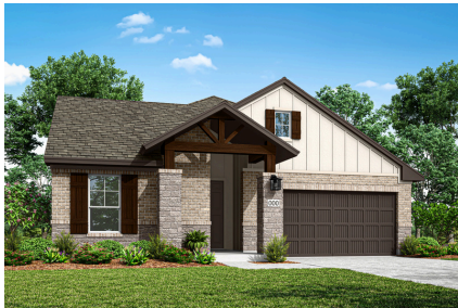
EXTERIOR STYLE B