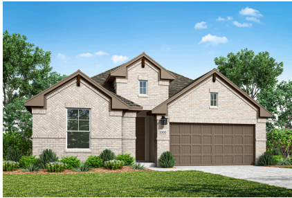
EXTERIOR STYLE A

2,018 Sq. Ft. | 3 Bed | 2 Bath | 2.5 Bay Garage | + Study