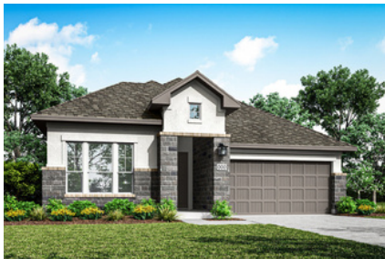
EXTERIOR STYLE C