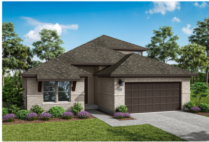
EXTERIOR STYLE A

2,466 Sq. Ft. | 4 Bed | 3.5 Bath | 2 Bay Garage | + Game Room