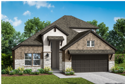
EXTERIOR STYLE C