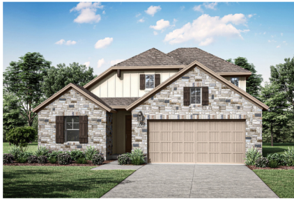
EXTERIOR STYLE E

2,466 Sq. Ft. | 4 Bed | 3.5 Bath | 2 Bay Garage | + Game Room