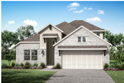
EXTERIOR STYLE F