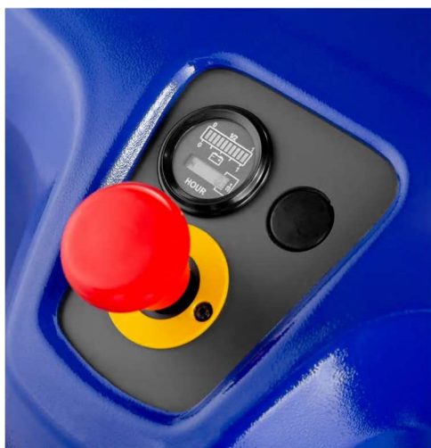
Electric lifting truck TWO