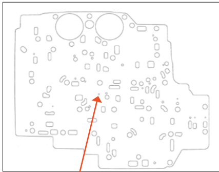
Step 1 Enlarge hole in plate and rivet

Detailed instructions are included inside packaging. Be sure to carefully follow them.