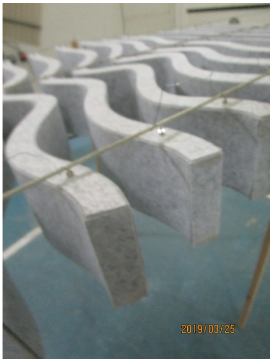
Figure 2 – Detail of specimen materials, undulations