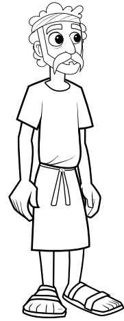
John was a fisherman and is James' brother.