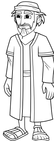
Matthew was a tax collector.