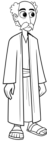
James was a fisherman and is John's brother.