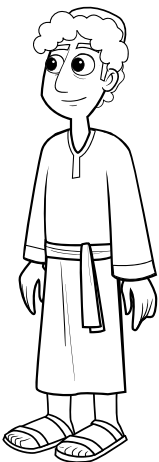
James Son of Alphaeus