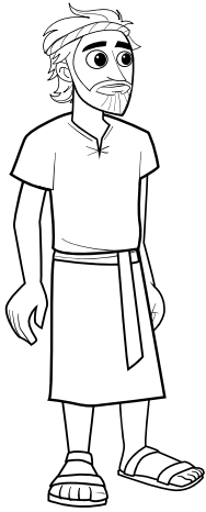
Peter was a fisherman.