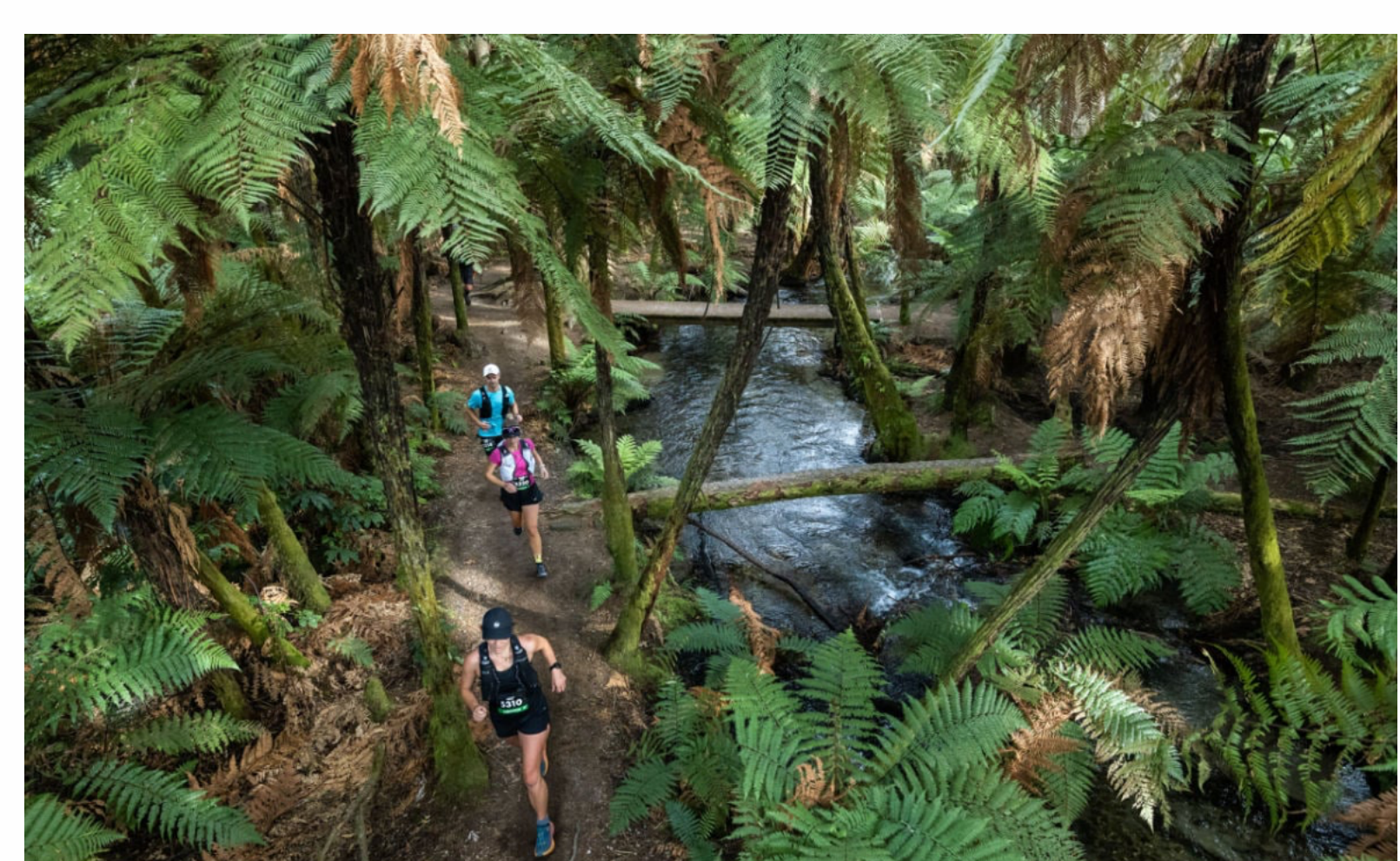
Tarawera Ultra-Trail by UTMB - high-res photo