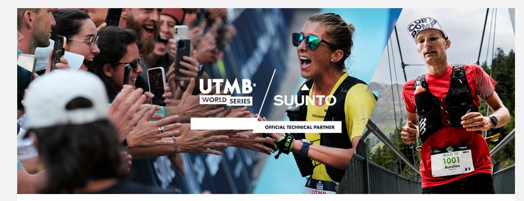
Press release - Chamonix, Thursday 15 February 2024