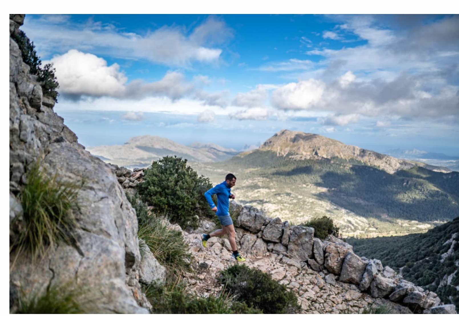
High-res photo

Mallorca, the largest of the Balearic Islands, is located in the middle of the Mediterranean, offering a unique environment for runners. Supported by both the Mallorca Council and the Balearic Government, Mallorca by UTMB promises an unforgettable experience, with a very diverse route, where participants will run along vertiginous cliffs, through lush oak and pine forests, and traverse the steep peaks of the Serra de Tramuntana UNESCO World Heritage Site, from where they can admire the splendour of the Mediterranean.