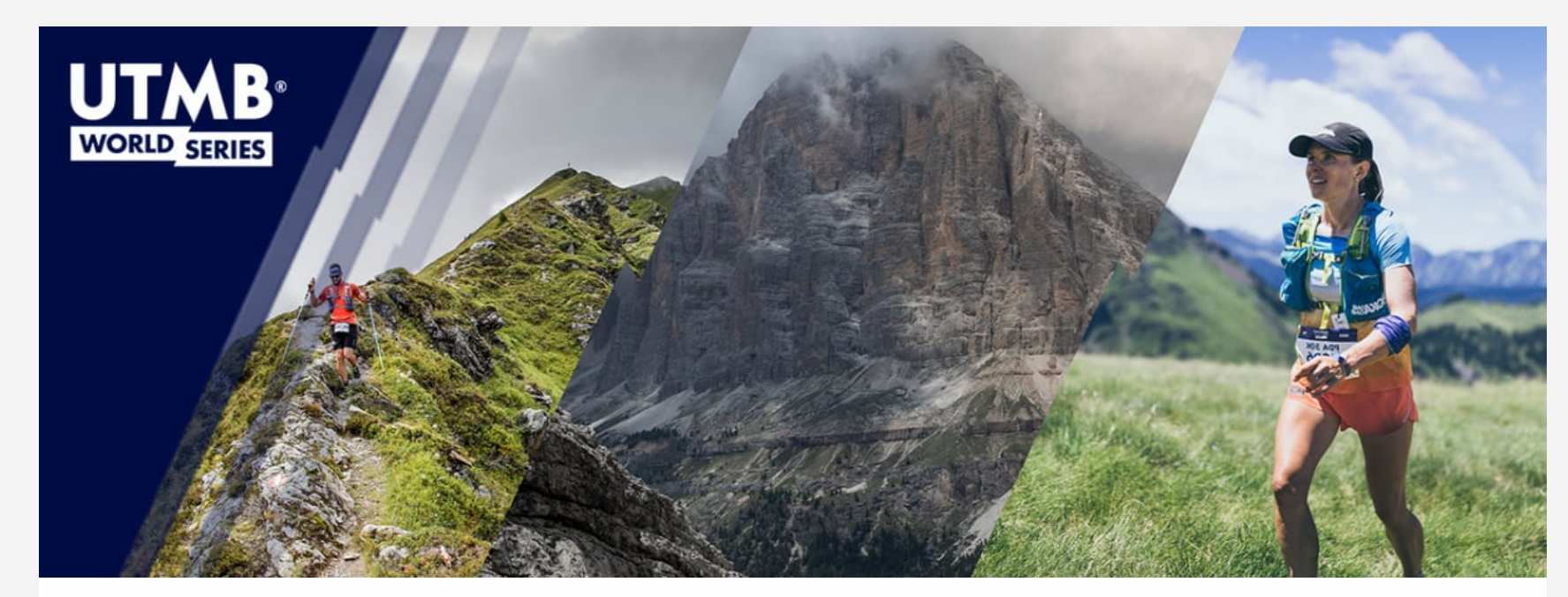
Press release - Chamonix (France), Sunday 7 April 2024