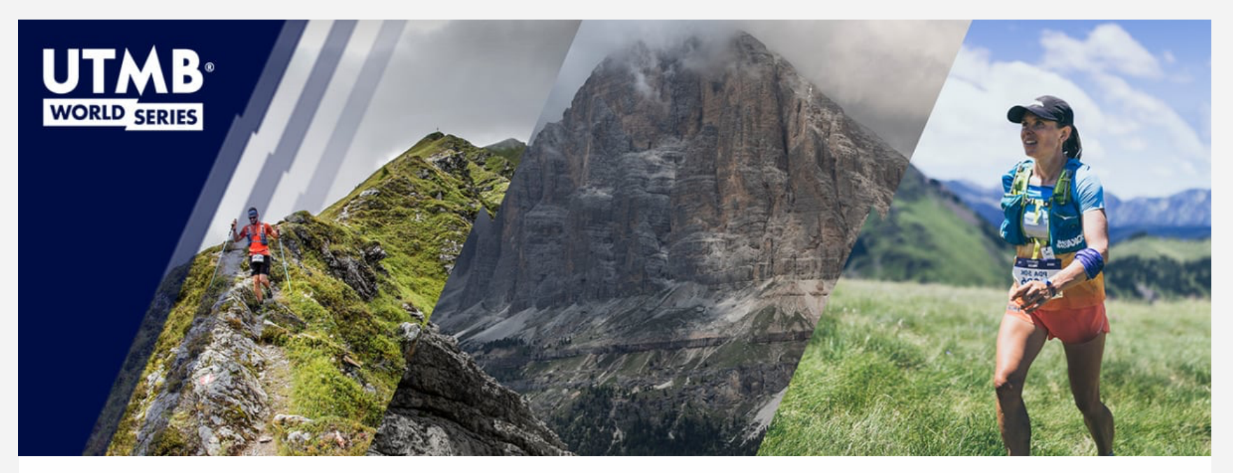
Press release - Chamonix (France), Tuesday 23 April 2024