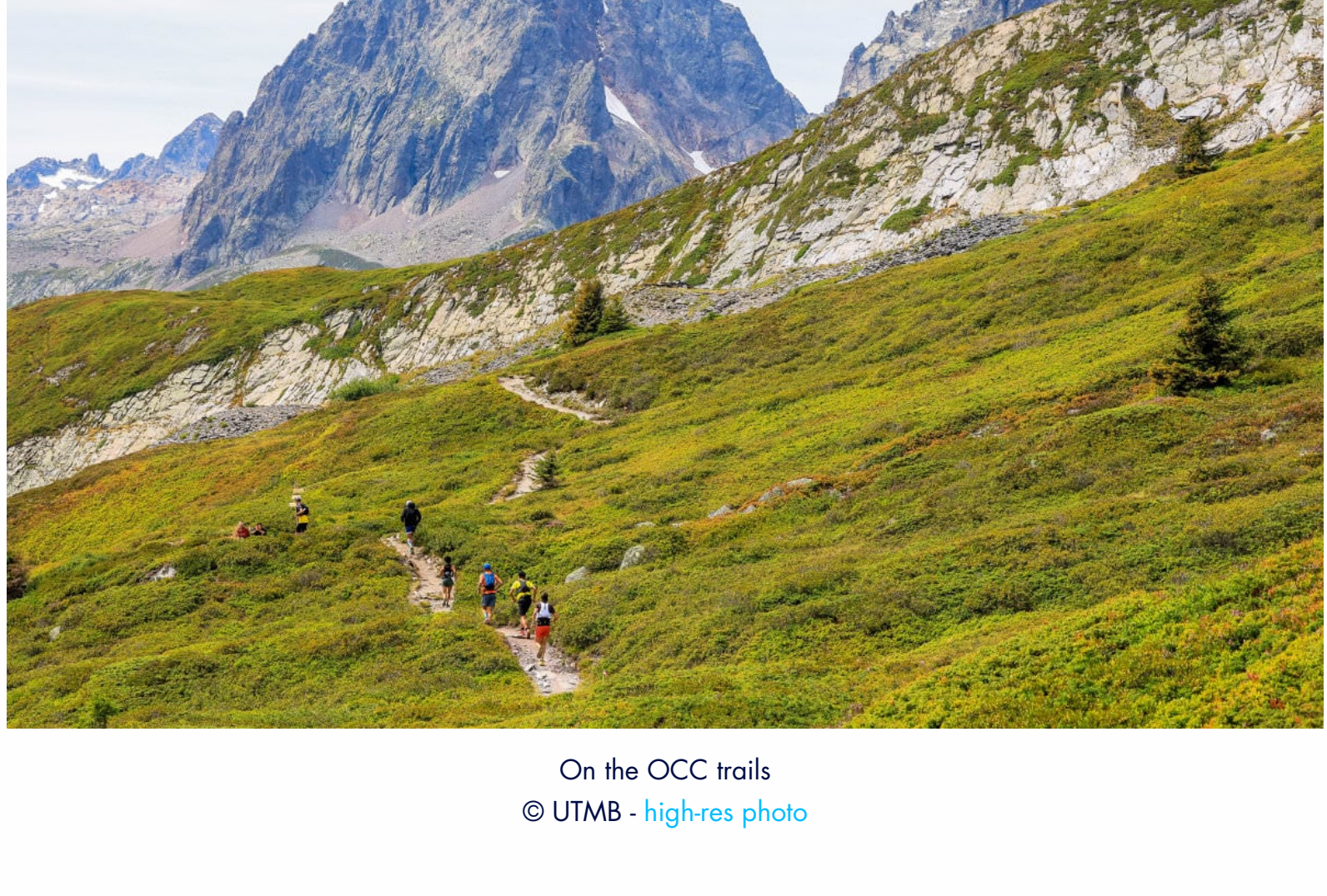
On the OCC trails - highres photo