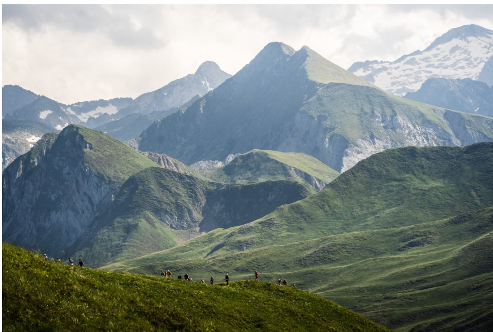
highres photo

From 2-6 July, the heart of the Catalan Pyrenees will come alive as it welcomes 6,000 runners from 83 nations to the 5 th edition of HOKA Val d'Aran by UTMB® . As the European UTMB® World Series Major, the event gives local and regional runners the chance to experience the unique UTMB® atmosphere on their doorstep. With 88% of participants coming from Europe , primarily the neighbouring areas of Spain, France and Portugal, it has become a firm favourite amongst local athletes eager to explore the Pyrenees trails, further cementing its status as the European Major .