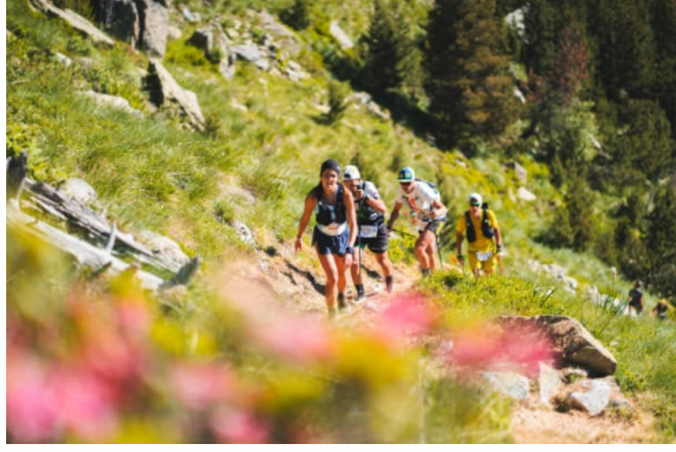
highres photo

In 2025, seven unique race distances are on offer to suit every level of trail runner. From the scenic brand new Vielha 10K race making trail running more accessible to all and offering even more action through a very fast race, to the flagship Torn dera Val d'Aran 100M , which has attracted 700 athletes who are eager to tackle this epic mountain challenge, without forgetting the 20K, 50K, and 100K races, there will be courses for everyone!