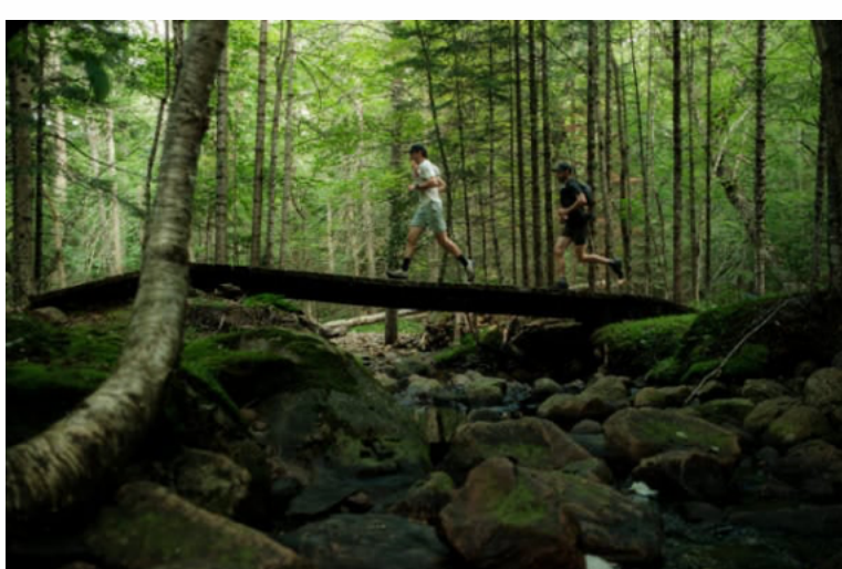
high-res photo

Registration opens on 9 September 2025 for UTMB Index Holders, and 11 September for all at https://gauja.utmb.world/