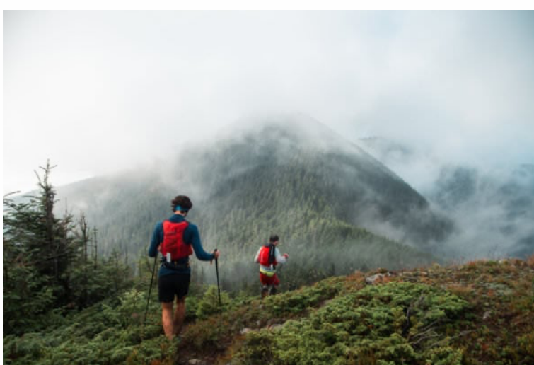
high-res photo