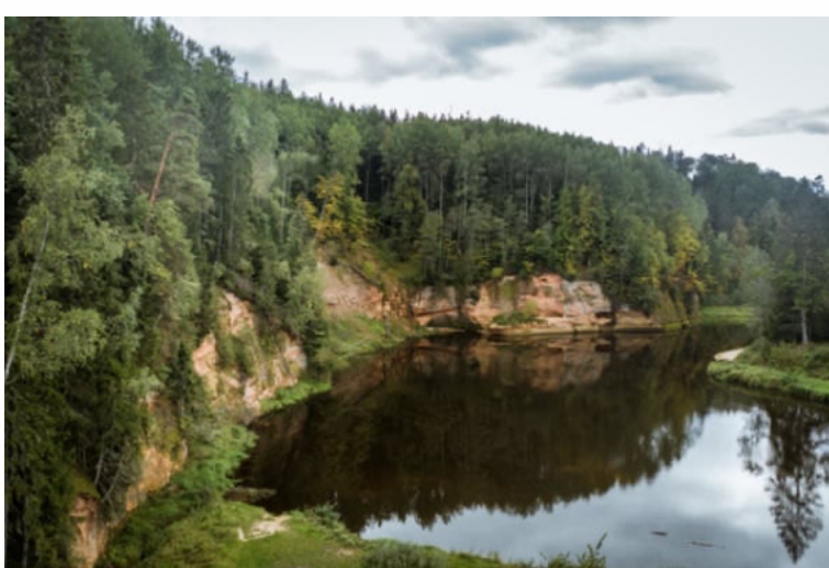
high-res photo