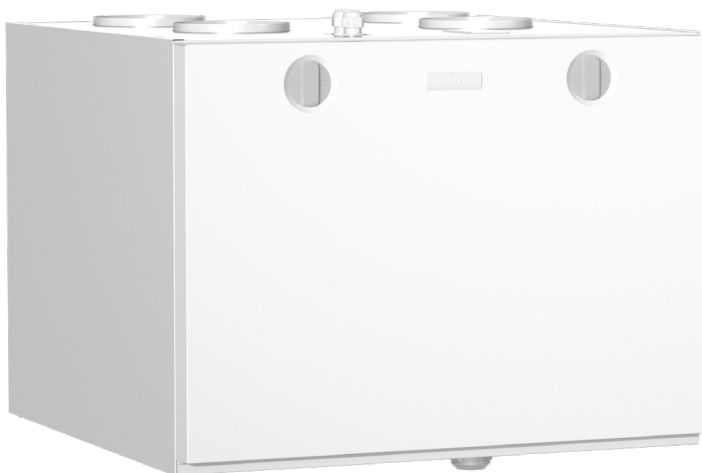
MyVallox ventilation unit