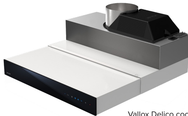
Vallox Delico cooker hood