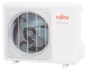
AOTG18 / 22LVCC / AOTG24LFCC