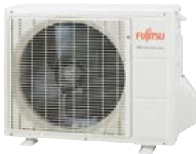
AOTG09 / 12LVCC