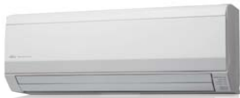
ASTG09 / 12 / 18 / 22LVCC