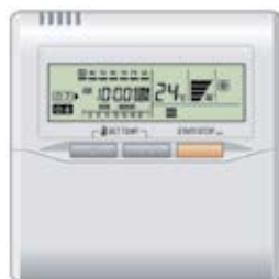
Wired Remote Controller*