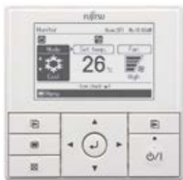
Backlit Wired Remote Controller*