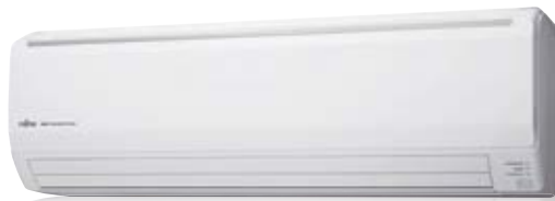
ASTG24 / 30 / 34LFCC