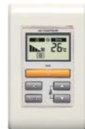
Simple Wired Controller*