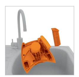
Rinse the filter and dirty water tank lid under warm water (max 40°C) to remove dirt/debris.