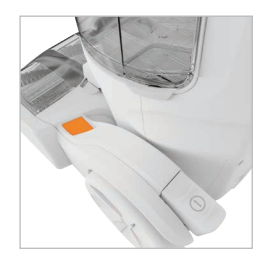
The mode indicator will illuminate DRY on the backward stroke.