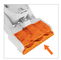
Push the nozzle backwards until it clicks into place.