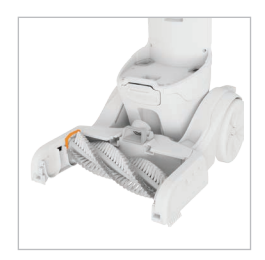
To replace the brushbars, align the right side of the first brushbar onto the circular gearing. Push the left tab downwards until it clicks into place. Repeat the same process with the other brushbar.