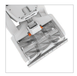
To replace the nozzle align the tabs at the top of the nozzle with the machine.