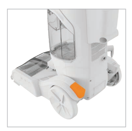
Plug the machine into the mains and press the On/Off pedal to switch on.