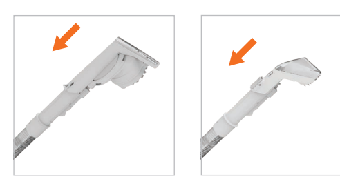
Select the SpinScrub or 2-in-1 Antimicrobial tool. Slide the tool over the tab at the end of the hose until it clicks into place.

Release the trigger on the backward stroke to pick up water/solution. For a dryer finish continue using dry strokes (trigger released) until little water is visibly passing through the tool.