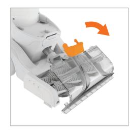
Lift the nozzle release clip and pull the nozzle forward to remove.