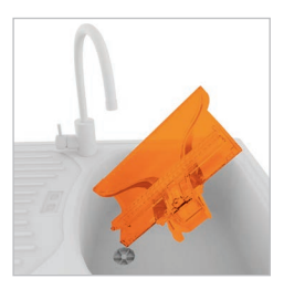
Rinse the nozzle under warm water (max 40°C) to remove dirt/debris.