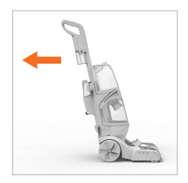
Slowly pull the machine backwards to pick up the water/solution.