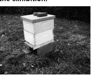
A beehive cared for by two friends in Holyoke, Massachusetts.

A desk at a press conference for an exhibition in Barcelona in 2008. I was paid an artist fee of almost 2000 GBP. The desk became part of my work for the exhibition.