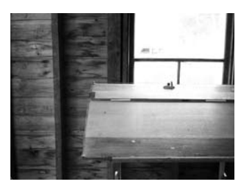
A studio at the Blue Mountain Center in the Adirondacks.

A fire in the forest clearing at the Blue Mountain Center in the Adirondacks. The Blue Mountain Center has a residency programme for artists, writers and activists. I was there for 2 weeks during 2010. All accommodation and food was paid for. The residency is supported by a private foundation.