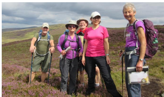
Photo by Hilary: "The going was very 'heatherly' as one person put it!"

"It had its ups and downs" Laura Northall