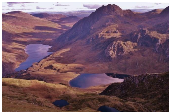
Tryfan and the Glyderau owe their shape to the ice age