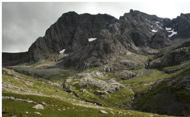
Ben Nevis in the 21st Century - some years no snow survives through summer

Fiddling around with PowerPoint one day, he tried to imagine Ben Nevis as it was and, with some subtle control of the mouse and the simple drawing tools that were available under 'shapes', he discovered he could make a fair stab at replicating couloirs, bergschrunds & crevasses, as well as the glaciers themselves as they tumbled out of Coire Leis and Coire na Ciste. So he took a photo of the Ben's north face and started applying his new-found skills. "The kids loved it: 'Sick!' is the best compliment a teacher can receive these days. And they may even have learned something from my efforts. I know I did. The next step was to find some usable and adaptable photos from around the UK and Ireland" As well as the images below, if you go online you can see how Bla Bheinn, the northern Cuillin, Scafell's, Cairngorms, Helvellyn, Ben Lui, Liathach & Macgillycuddy's Reeks might have looked 10,000 years or so ago.