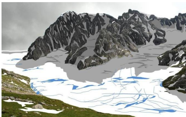
Ben Nevis with added glaciers. Accessing routes might've been tricky, but just think of the conditions