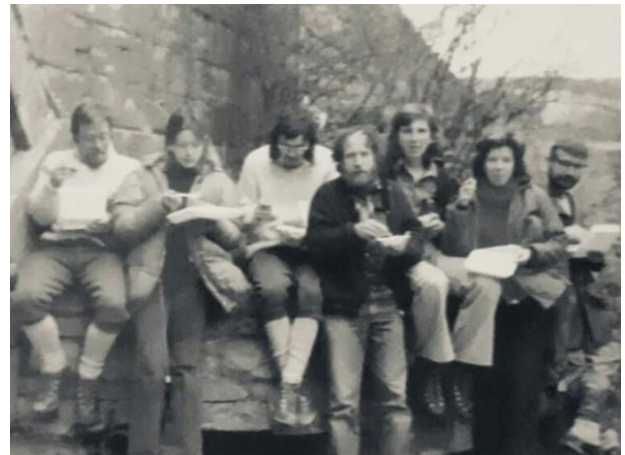
Some of the WBMC Family enjoying fish & chips