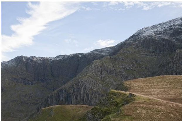
Llech Ddu Spur

Mynydd Du provides an easy angled descent ridge. This route is possible in any weather and is always deserted.