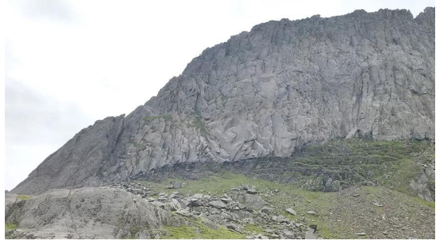
Clogwyn y Person Arete

scramble/climb. The quietest descent will be down the Cwm Glas Spur to pick up the outward path. Even in normal times this side of Snowdon is deserted so the two-metre rule should be no problem and, as a bonus, the rock is great.