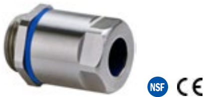
ABB Cable Glands – FSCG Series