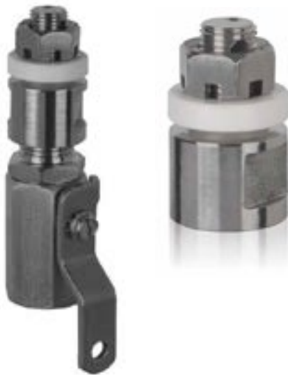
ABB Stainless Steel Drain Adaptor