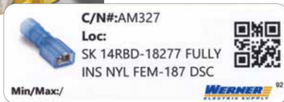
Scannable label (sample)

We will put away orders and organize storage solution carts during our visits.