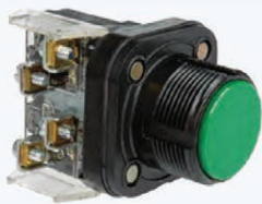
Operator with factory installed contact blocks