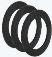
Gaskets provide type 4/13 ingress protection