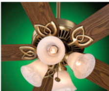
Holds a 70 lb fan

Arlington's extra heavy-duty, plated steel fan/fixture box now has higher UL weight ratings: