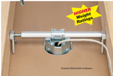
Finished FBR54200R installation