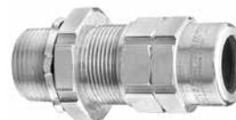
Dimensions in Millimeters (Inches)