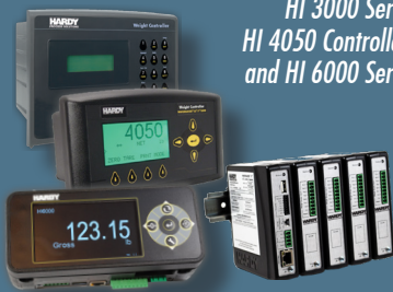
HI 3000 Series HI 4050 Controllers and HI 6000 Series