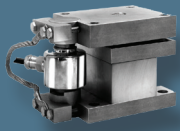
ADVANTAGE Series Load Point with C2 Calibration

Hardy carries a wide variety of strain gauge load points and scale bases to accommodate your application requirements.