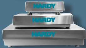
Hardy Bench Scales