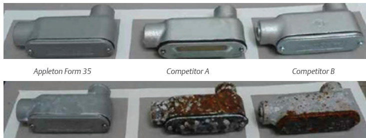
Before and after photographs. Above photo are new conduit bodies and below photo shows same conduit bodies after 42 days in salt fog chamber

To demonstrate just how durable our triple-coat finish is, we asked Intertek, a nationally recognized 3rd party testing laboratory, to subject one of our iron products, in this case our Appleton Form 35 conduit bodies, to a salt fog chamber test per ASTM B-117 standard. To prove the effectiveness of our triple-coat finish we also tested equivalent iron conduit bodies from our top two competitors in this space. This test shows the relative corrosion resistance of the specimens visibly, but is not designed to evaluate product functionality. See emerson.com for full test results and additional information.