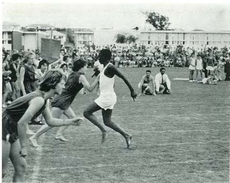
The Relay Race.