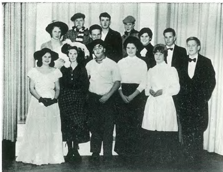
Cast of "Pygmalion".