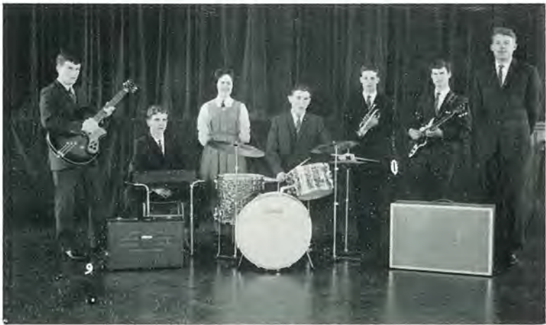
THE SCHOOL DANCE BAND