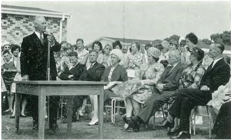
The Prime Minister at the School Open Day.