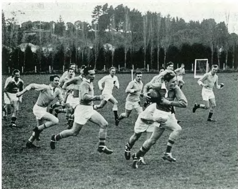
Old Boys' v. School Rugby Match.