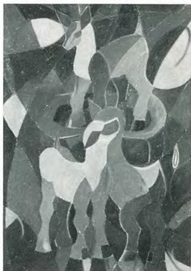
Analagous Composition —Mieke van Dam