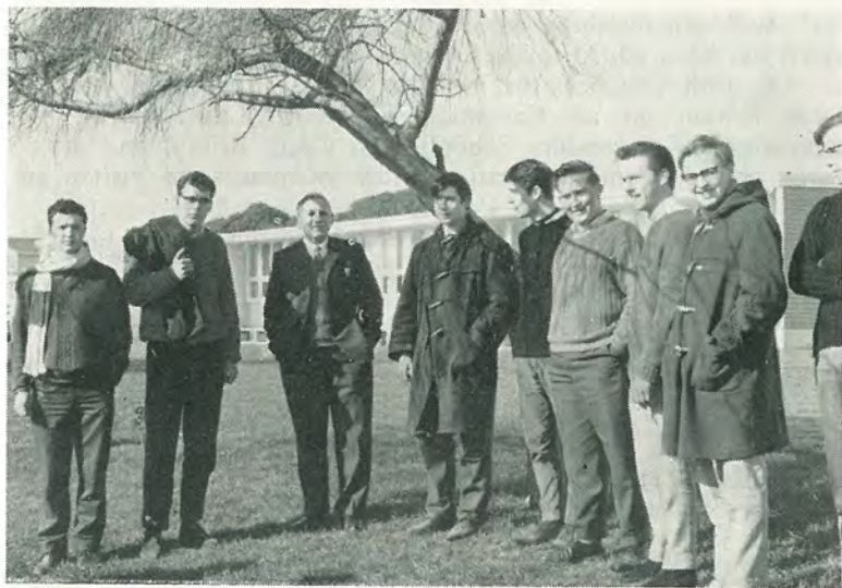
Old Boys' Visit the School