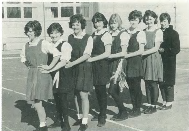
Old Girls' Basketball Team