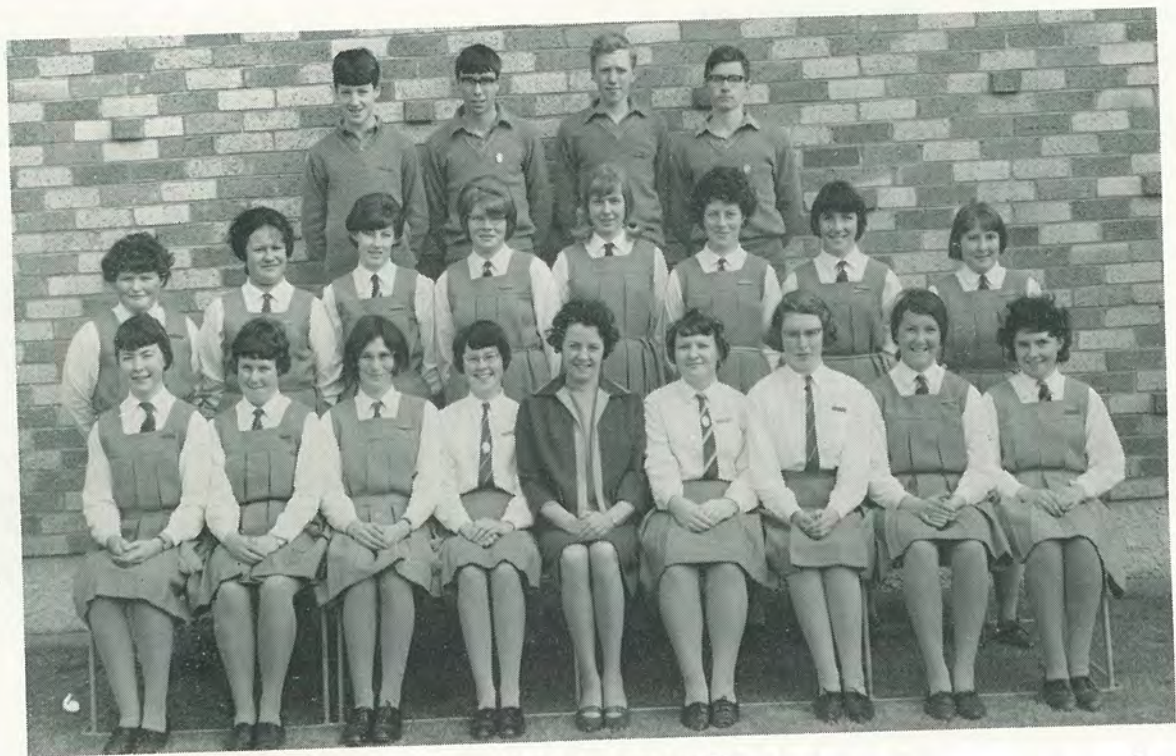
THE LIBRARY COMMITTEE