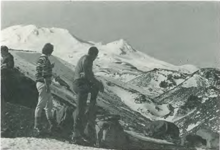
On the Mountain

Ngauruhoe was the next to be climbed but once again this