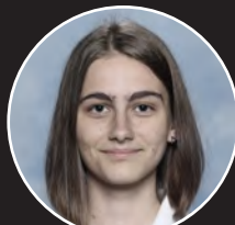
Merle Chant Design