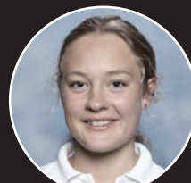
Aranga Molijn Health and Physical Education