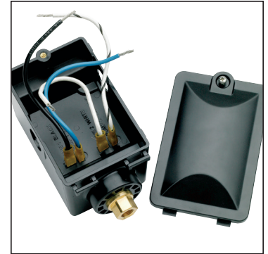
Access cover is sealed against moisture and bugs.