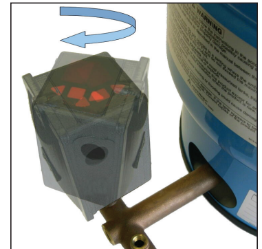
Spins on—no special fittings. LED display rotates 180°.