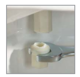
STA-TITE® SEAT FASTENING SYSTEM™