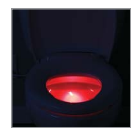
BUILT-IN NIGHT LIGHT