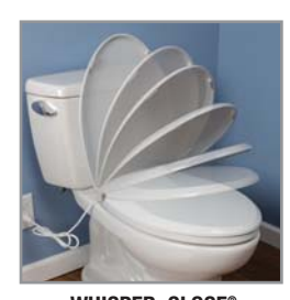
WHISPER • CLOSE®