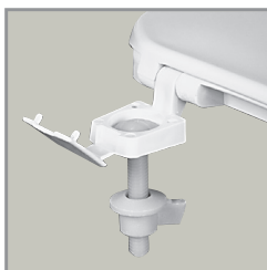
NON-CORROSIVE BOLTS AND WING NUTS