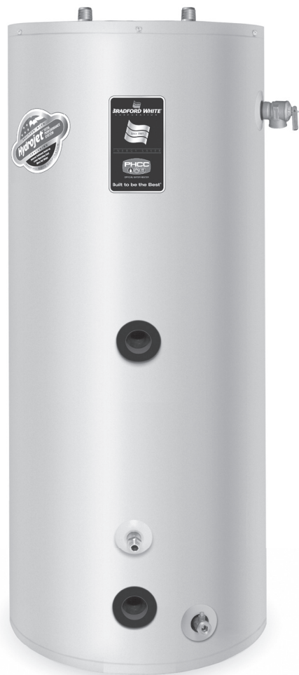
Photo is of SW-2-65-L