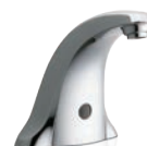
E-Tronic® 40 8-9