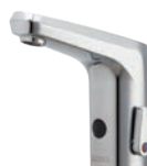
E-Tronic® 80 6-7