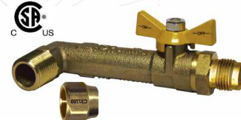
1/4 TURN 90° BALL VALVE MALE FLARE TO MALE PIPE