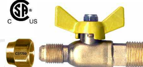
1/4 TURN BALL VALVE MALE FLARE TO MALE PIPE