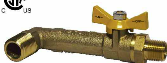
1/4 TURN 90° BALL VALVE MALE PIPE TO MALE PIPE