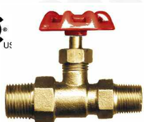
MALE PIPE TO MALE PIPE