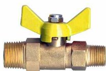
1/4 TURN BALL VALVE MALE PIPE TO MALE PIPE