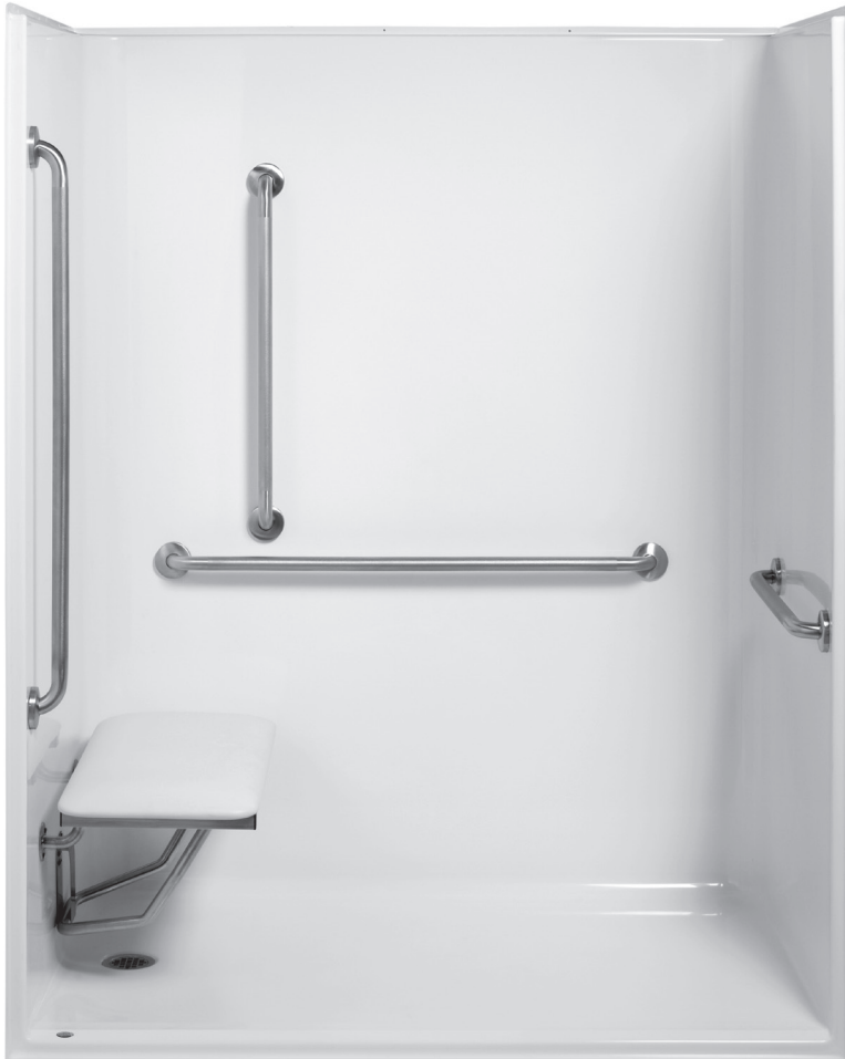
Model 6296LHA-F1 (shown with optional folding seat)

Left Hand Drain, Left Hand Vertical Bars, Right Hand Horizontal Bar