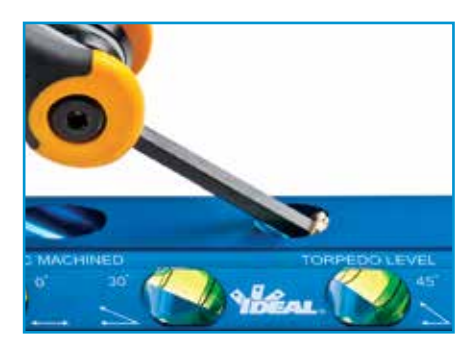
1. Remove the set screw with hex wrench

The most frequent failure of spirit levels is damage to the vials. IDEAL Precision Levels feature tough, molded acrylic vials with shock-absorbing rubber O-rings, which virtually eliminate shock damage to the vials. Additionally, unlike most competitors' vials, which are typically glued into their levels, IDEAL vials are designed for easy field replacement.