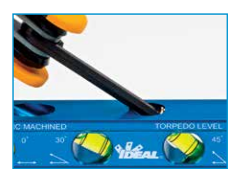
4. Reinstall O-ring and set screw