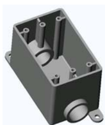
RFDC10, RFDC15, RFDC20 \frac{1}{2} ", \frac{3}{4} ", 1"