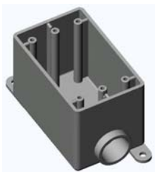
RFDS10, RFDS15, RFDS20 \frac{1}{2} ", \frac{3}{4} ", 1"

Single Gang Deep Boxes are available in various configurations, with sockets to accommodate \frac{1}{2} ", \frac{3}{4} " and 1" PVC rigid conduit.